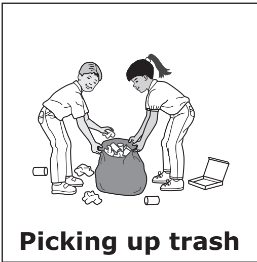
Picking up trash